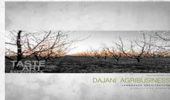
Fruit Tree Portfolio