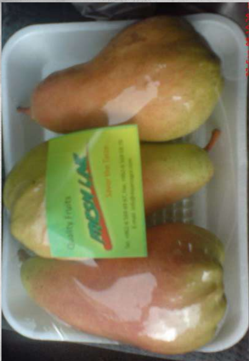
Abate Fetel Pear